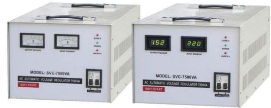
SVC-5000VA SVC-7500VA SVC-10KVA