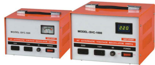
SVC-500VA SVC-1000VA SVC-1500VA