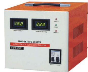
SVC-2000VA SVC-3000VA SVC-5000VA